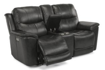
1183-64PH Power Reclining Loveseat with Console and Power Headrests